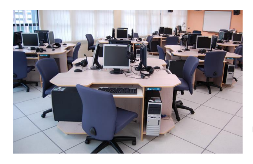
• A fully-equipped language lab