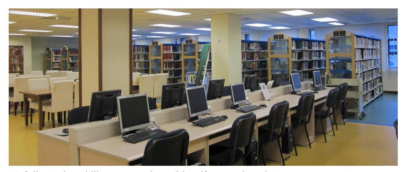
• A fully-equipped library, complete with self-access learning resources

administration and operation of these three libraries. Besides, the library has become a benchmark in developing and implementing updated high-technology library management systems such as the library materials' security system, library materials' tracking system and self-service book loan/return system. The library has an updated collection in various forms of printed, multimedia and electronic materials. The library's material search can be accessed through the Online Public Access Catalogue (WebOPAC) at http://webopac.kln.gov.my. Meanwhile, detailed library information can be accessed via its portal at www.idfr.gov.my/library.