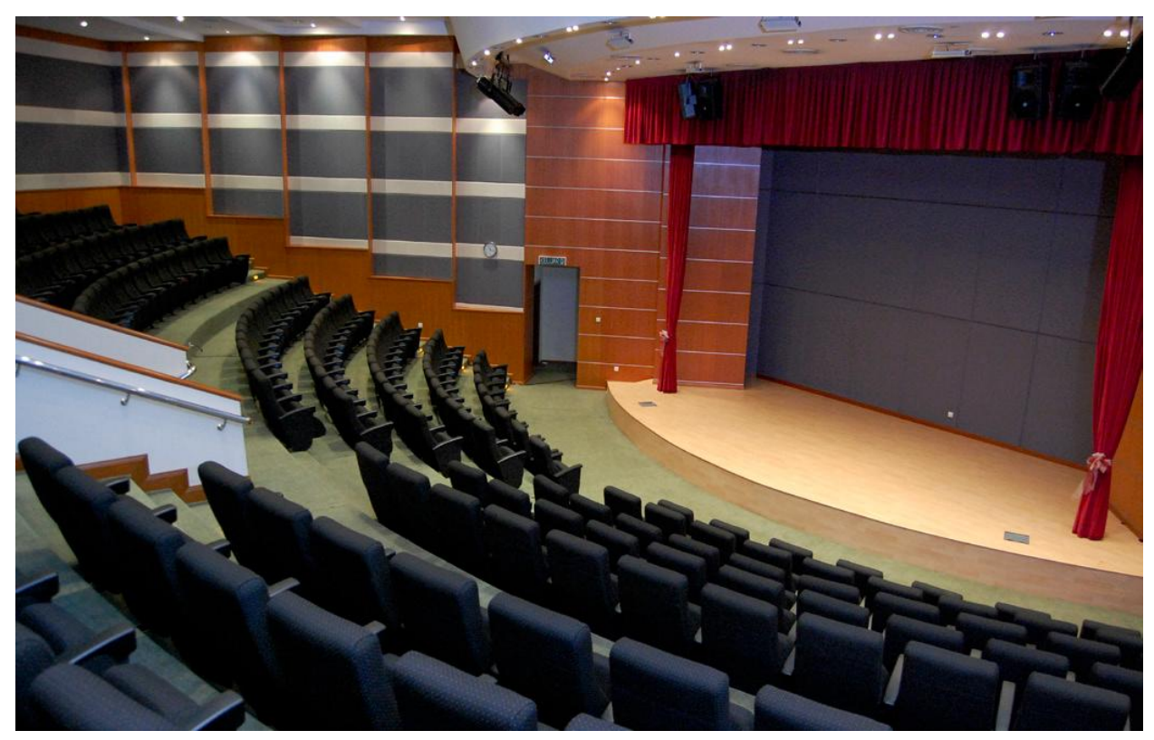
\bullet A new auditorium which can accommodate up to 250 people, with PA and theatre lighting systems