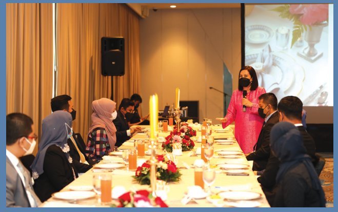
The Diploma in Diplomacy participants learning the art of fine dining, 12 October 2021