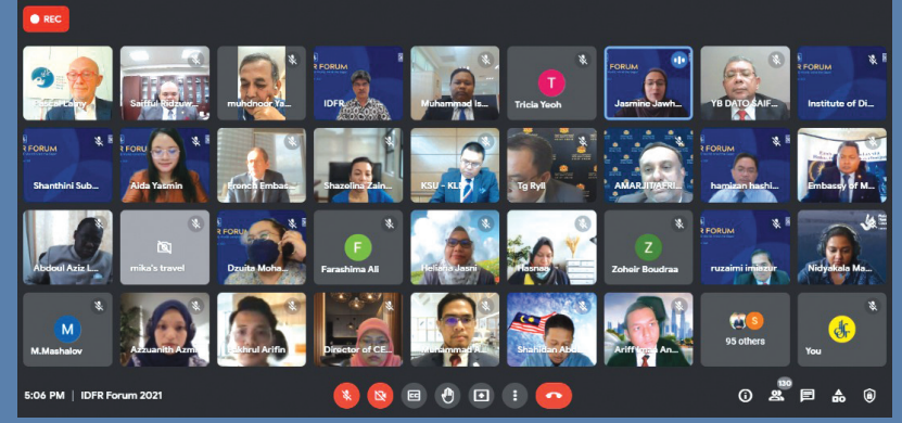
More than 100 participants attended IDFR's inaugural annual forum, 14 September 2021

Ms. Nuril (centre in grey scarf and black mask) and the volunteers from HCO G on their last day, 8 September 2021