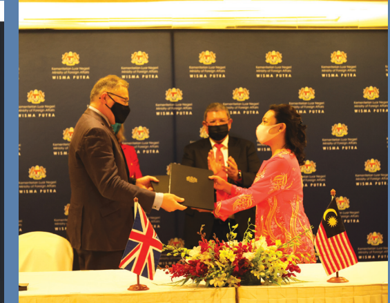
The signing of Exchange of Notes between IDFR and UK International Academy, 8 November 2021