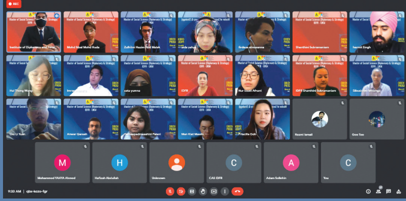
The orientation for the 2021 Master programme was held online, 4 October 2021