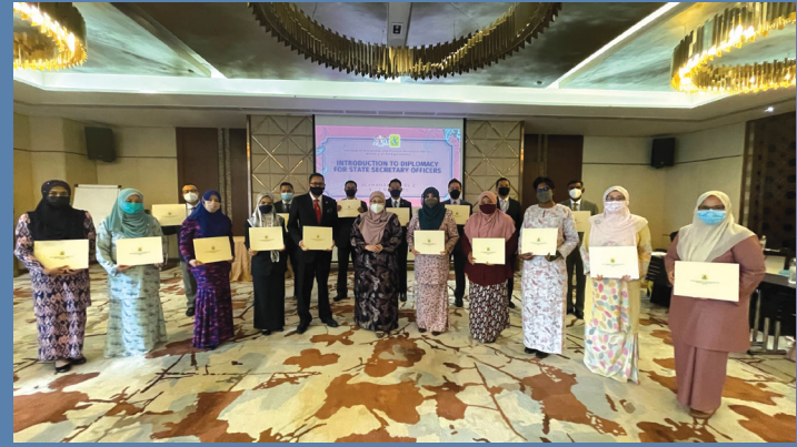
At the certificate presentation ceremony of the Introduction to Diplomacy for State Secretary course, 3 November 2021