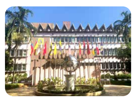
IDFR's main block